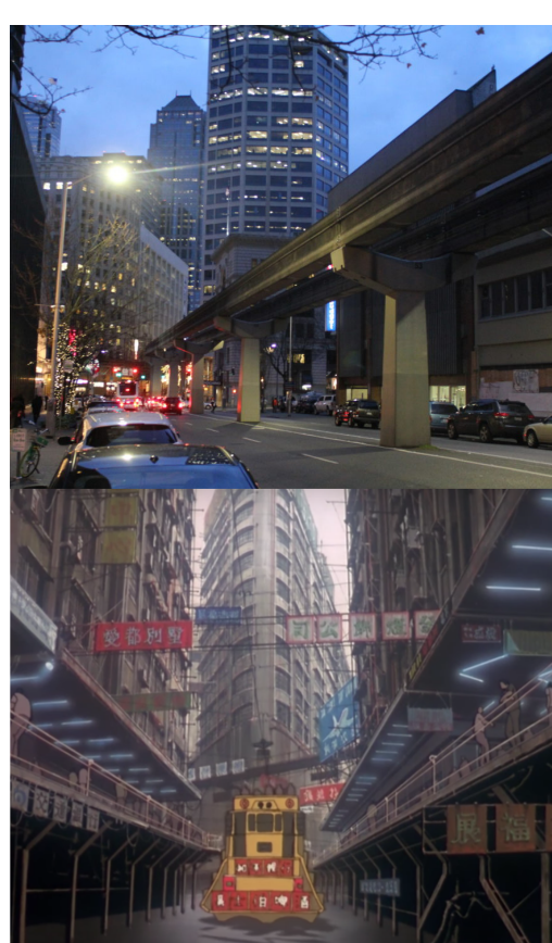
"3 anime films that prove that Seattle's dystopian future is now" by Gavin Amos-Lopez (2017 Apprentice)

Our more than 600 writers are 40% people of color and 20% foreign born. They are professional and citizen reporters, including development workers, community organizers, students, immigrants, refugees and artists.